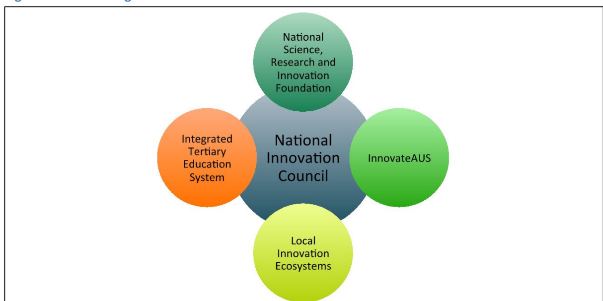
Figure 1: Five Strategic Action Areas

The Report's view on the scope of these Strategic Action Areas (SAAs) is covered in Part II of the Report. Part I provides an overview of the issues behind the recommended Actions.